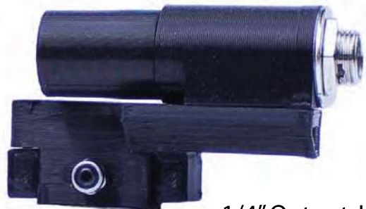
1/4" Output Jack