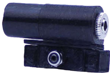
1/8" Output Jack

The Neo Jack is available with a 1/8" jack or a standard 1/4" jack.