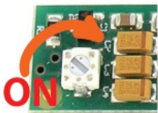
Rotate Clockwise For More Gain